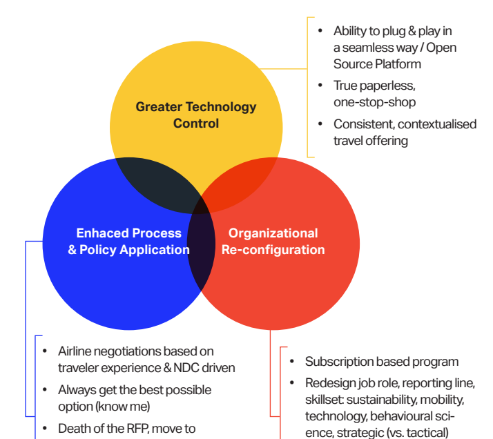
Figure 4: The Long Term, Strategic Changes Summarised