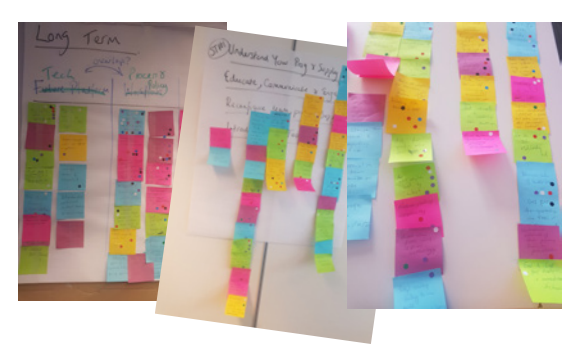
The Ideation Phase at Ingersol Rand HQ, Brussels