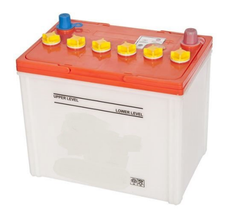
Figure 3 – Example of Spillable Wet Battery

△ Spillable wet batteries . c onsist of a series of metal plates immersed in an electrolyte. The electrolyte is a corrosive liquid such as dilute sulphuric acid. Spillable batteries will leak the corrosive electrolyte if not maintained in an upright condition throughout transport, including loading and unloading.