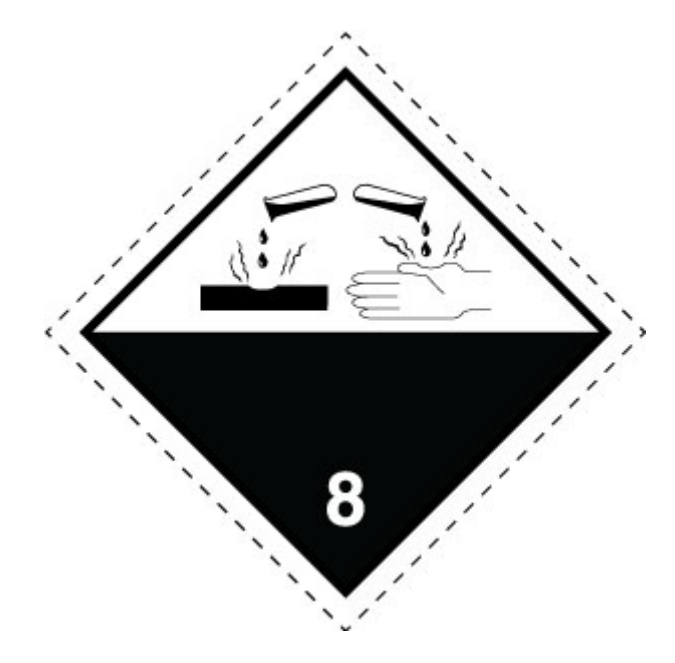
Figure 1 – Corrosive label