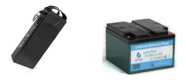
Figure 1 – Examples of Lithium Ion Batteries

Lithium-ion batteries (sometimes abbreviated Li-ion batteries) are a secondary (rechargeable) battery where the lithium is only present in an ionic form in the electrolyte. Also included within the category of lithium-ion batteries are lithium polymer batteries. Lithium-ion batteries are generally used to power devices such as mobile telephones, laptop computers, tablets, power tools and e-bikes.