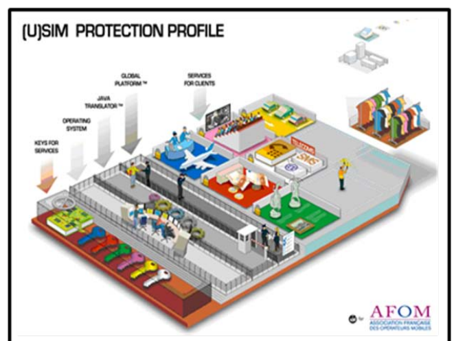
Figure 7: Example of multi-SDs in a UICC to support multiple applications

On the UICC, specific Security Domains (SDs) are created. This recently standardized technology enables Services Providers (SPs) such as Airlines or Airport Authorities to have specific SDs allocated to them. Each SD has unique encryption keys, providing the right level of confidentiality, data integrity and authentication necessary for the SP’s services. This means that an airline application can securely reside in any UICC (that conforms to the standards). This provides flexibility and interoperability, as there is no need to develop a specific application for a specific device or a specific Mobile Network Operator. Figure 7 shows an example of the multi-SDs possible in a UICC to support multiple applications.