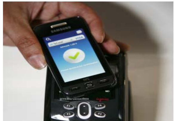
Figure 2: Example of a Mobile Payment transaction

In Card emulation mode, the mobile device can be used to perform secure transactions such as mobile payments (see Figure 2).