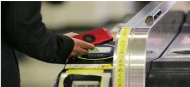
Figure 3: Example of mobile ticketing