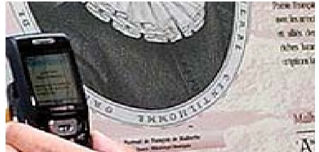
Figure 6: Examples of using an NFC phone to access information from a tag