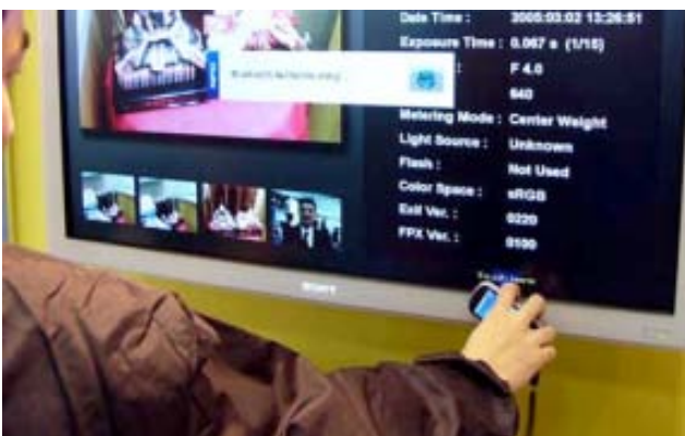
Figure 5: Examples of using an NFC phone to access information from a tag

In Reader-Writer mode, there is a one-way data exchange from typically a Radio Frequency IDentification (RFID) tag to the mobile device. This permits the mobile phone to be used to access information such as bus time-tables, information about historic places or museum pieces simply by bringing the mobile phone near to an RFID tag (see figures 5 and 6)