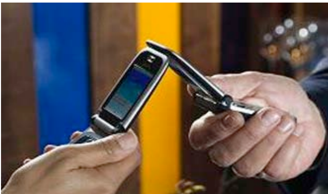
Figure 4: Example of exchanging business cards

In Reader-Writer mode, there is a one-way data exchange from typically a Radio Frequency IDentification (RFID) tag to the mobile device. This permits the mobile phone to be used to access information such as bus time-tables, information about historic places or museum pieces simply by bringing the mobile phone near to an RFID tag (see figures 5 and 6)