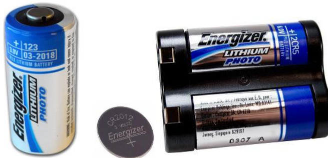
Figure 1 - Example of Lithium Metal Cells and Batteries

Lithium metal batteries packed by themselves (not contained in or packed with equipment) (Packing Instruction 968) are forbidden for transport as cargo on passenger aircraft). In accordance with Special Provision A201, lithium metal cells or batteries that meet the quantity limits of Section II of PI 968 may be shipped on a passenger aircraft under an approval issued by the authority of the State of Origin, State of Destination and State of the Operator. All other lithium metal cells and batteries can only be shipped on a passenger aircraft under exemption issued by all States concerned, see Special Provision A201.