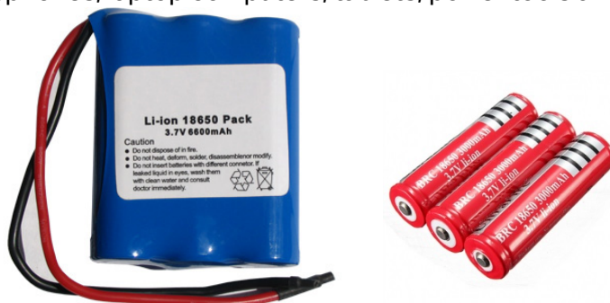
Figure 2 - Example of Lithium Ion Cells and Batteries

Lithium-ion batteries (sometimes abbreviated Li-ion batteries) are a secondary (rechargeable) battery where the lithium is only present in an ionic form in the electrolyte. Also included within the category of lithium-ion batteries are lithium polymer batteries. Lithium-ion batteries are generally used to power devices such as mobile telephones, laptop computers, tablets, power tools and e-bikes.