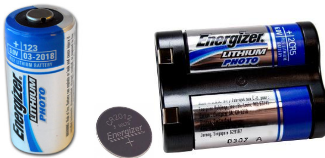
Figure 1 - Example of Lithium Metal Cells and Batteries

Lithium metal batteries packed by themselves (not contained in or packed with equipment) (Packing Instruction 968) are forbidden for transport as cargo on passenger aircraft). In accordance with Special Provision A201, lithium metal cells or batteries that meet the quantity limits of Section II of PI 968 may be shipped on a passenger aircraft under an approval issued by the authority of the State of Origin, State of Destination and State of the Operator. Or in the case of urgent medical need, one consignment of lithium batteries may be transported as Class 9 (UN 3090) on passenger aircraft with the prior approval of the authority of the State of origin and with the approval of the operator, see Special Provision A201. All other lithium metal cells and batteries can only be shipped on a passenger aircraft under exemption issued by all States concerned.