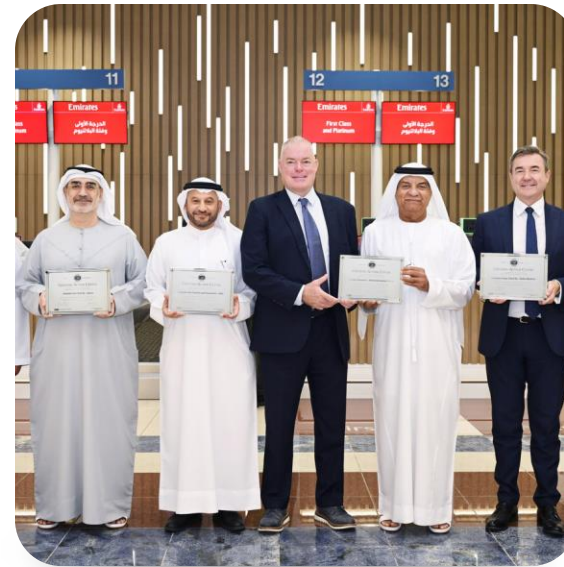
Emirates City Check-Ins