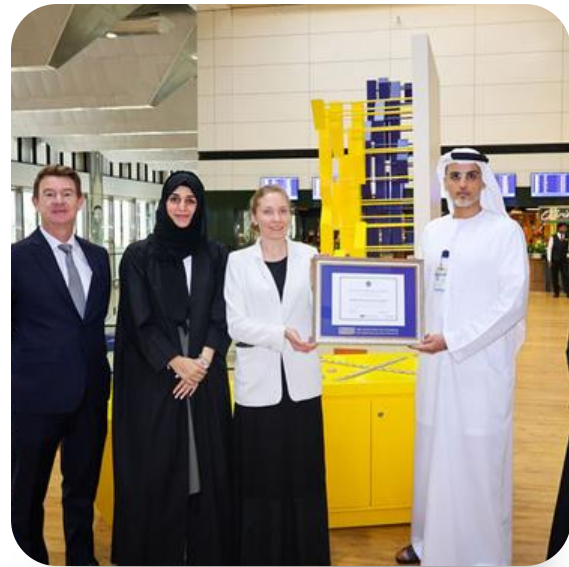
Dubai International Airport