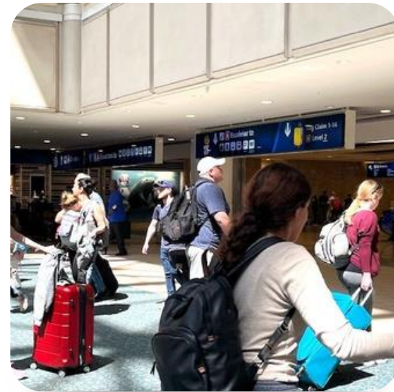
Orlando international Airport