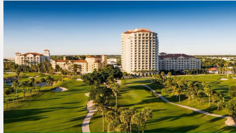
JW Marriott Miami Turnberry Resort & Spa