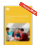
ONE Record API