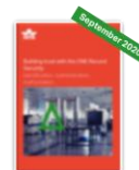
ONE Record Security