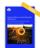
ONE Record Data Model