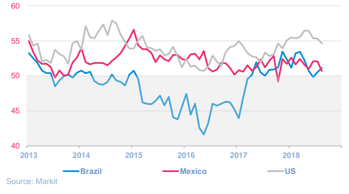
50=no change, seasonally adjusted