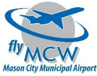
Mason City Municipal Airport