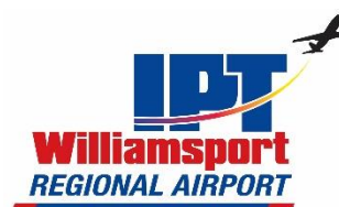
Williamsport Regional Airport