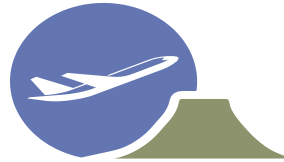
Northeast Wyoming Regional Airport