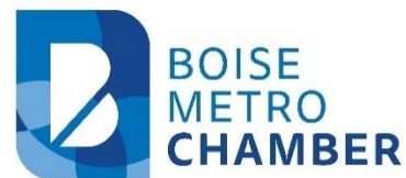
Boise Metro Chamber