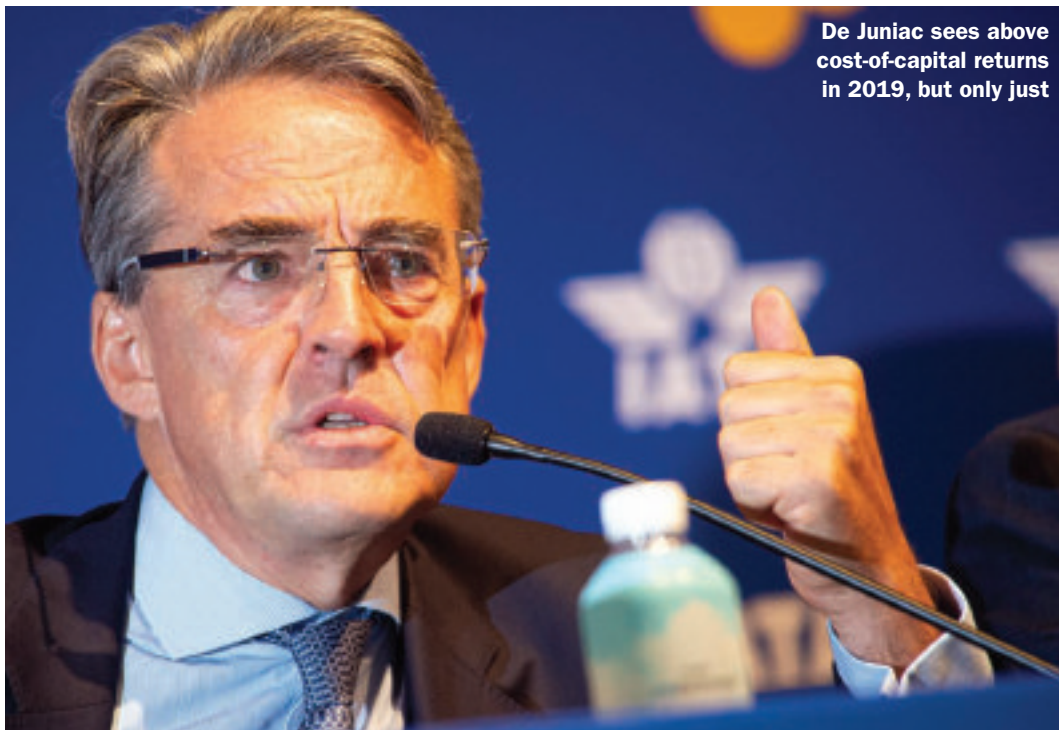
De Juniac sees above cost-of-capital returns in 2019, but only just