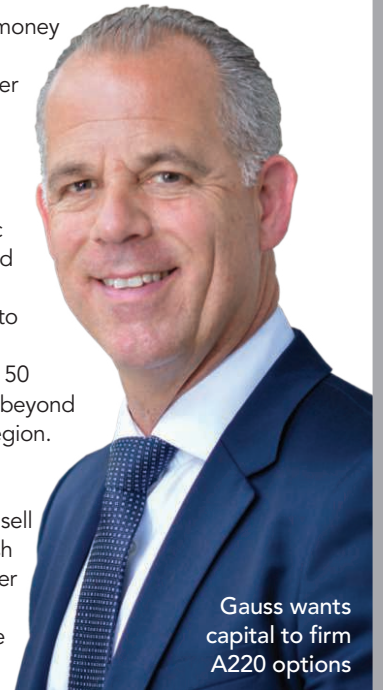
Gauss wants capital to firm A220 options

The carrier has an additional two leased 737s whose contracts are due to expire next year.