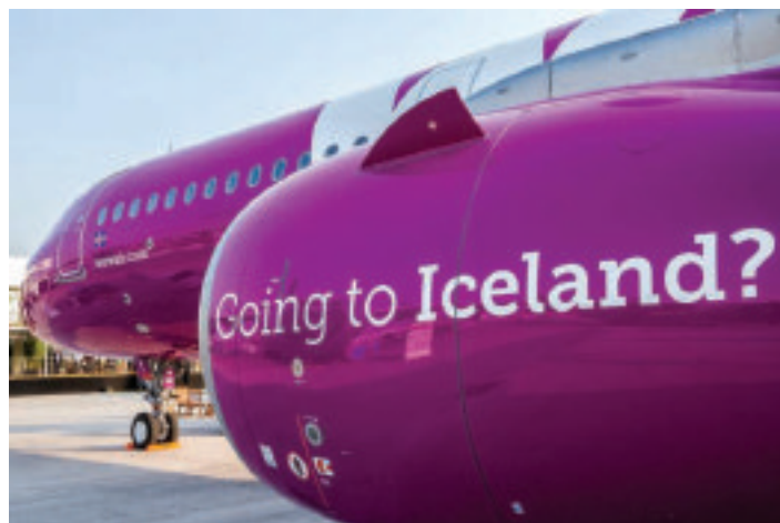
Wow Air was deploying a range of aircraft on transatlantic routes

revealed plans to use the Airbus narrowbodies to enter the transatlantic fray. In April it outlined plans to begin services from New York JFK and Boston to one or more unspecified London airports in 2021 using A321LRs it has on order.