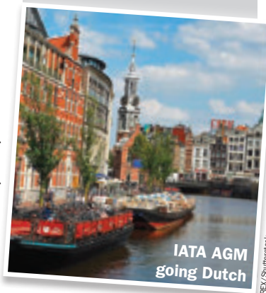
IATA AGM going Dutch

"But under current circumstances, the great achievement of the industry-creating value for investors with normal levels of profitability is at risk. Airlines will still create value for investors in 2019 with above cost-of-capital returns, but only just."