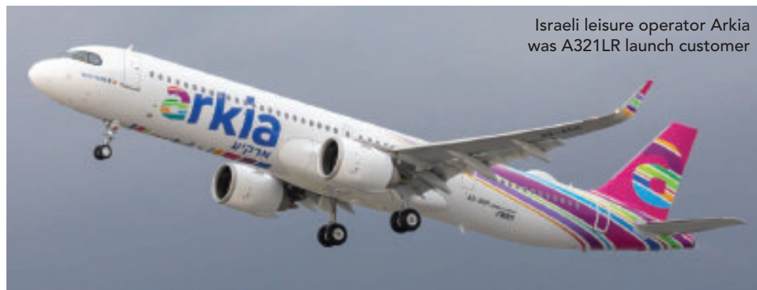
Israeli leisure operator Arkia was A321LR launch customer