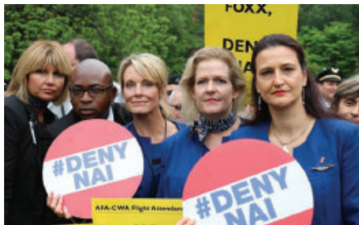
Norwegian’s ownership structure was behind protests in the USA