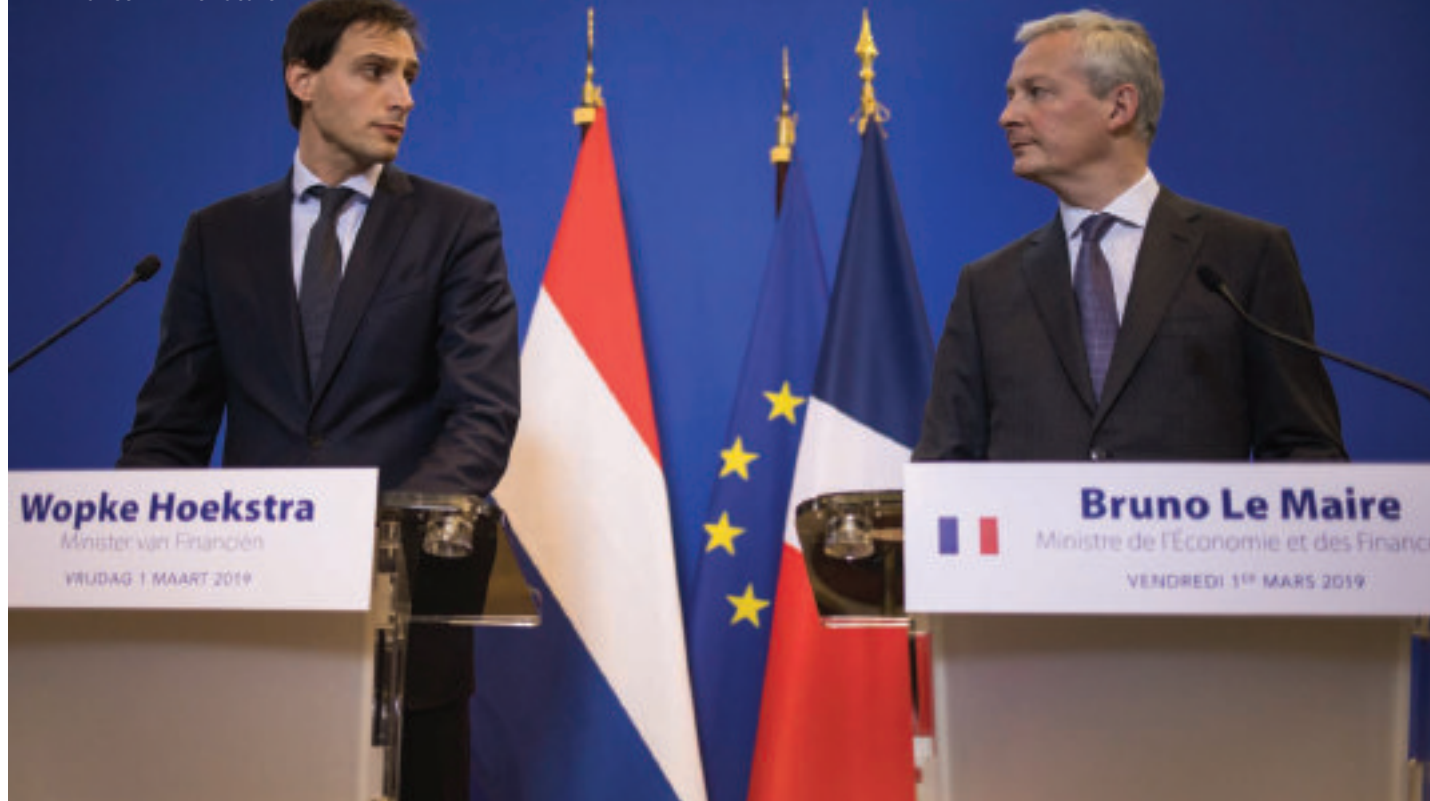
Dutch and French finance ministers met to discuss Air France-KLM's future

IATA has therefore cooled its line on the issue and no longer actively promotes its Agenda for Freedom. »