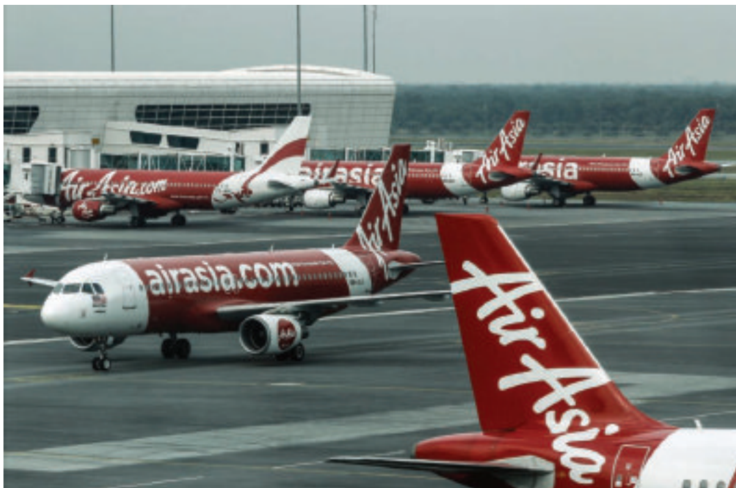
AirAsia has long lobbied for liberalisation of regulations