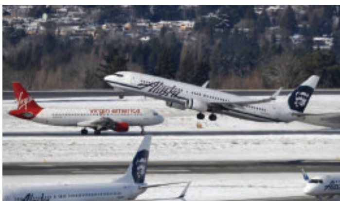
The Virgin America brand is disappearing after its Alaska merger

As things stand, IATA is unlikely to be a source of any momentum on the issue. “In short, because the restrictions on foreign investment in airlines do not appear to have impeded the industry’s growth or development, the issue is not on IATA’s agenda,” it said last year and reiterated in early 2019. ■