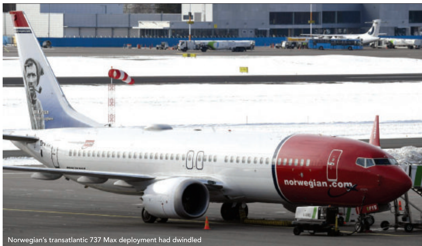
Norwegian's transatlantic 737 Max deployment had dwindled