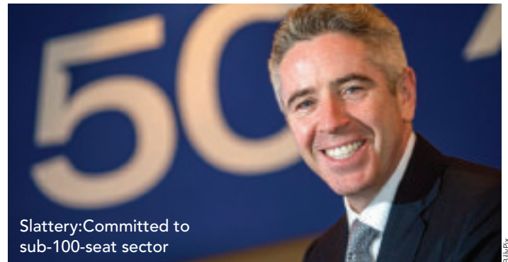
Slattery: Committed to sub-100-seat sector

of noise around the issue that the aircraft is not scope-compliant in the US from a weight perspective," Slattery told FlightGlobal at the IATA AGM.