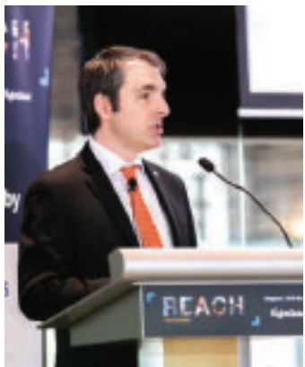
Whitelaw: disruptive forces

He notes that one of SkyTeam's focus areas is dealing with basic expectations. For example, in distribution, a ticket's price can