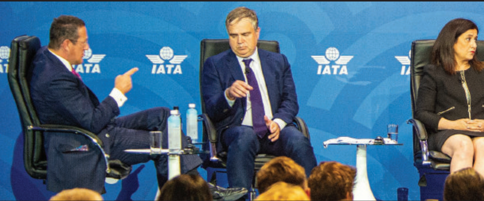
Richard Quest News anchor CNN

Senior airline chiefs were put through their paces again by CNN's Richard Quest in the regular CEO panel debate at the World Air Transport Summit yesterday. While the grounding of the Boeing 737 Max was first on the agenda, the wide-ranging debate also tackled issues as diverse as competition, environment and ownership